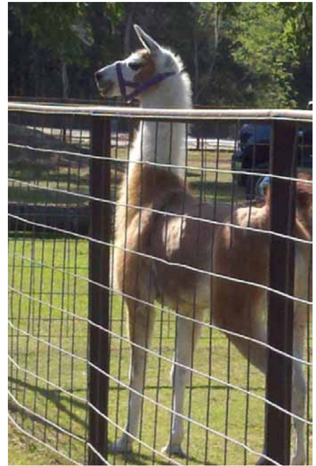
Before the attack, Lorenzo was curious, proud and confident.

Although our pasture has now become green and cool under the trees, the llamas have not returned to graze in it. They sense the sadness and loss of their companion, WLK La Tida.