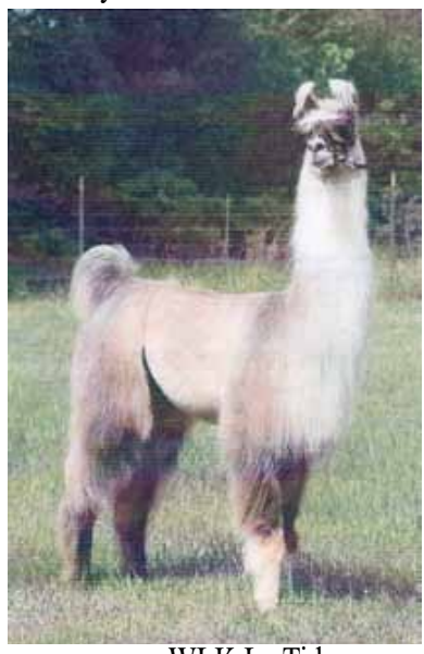
WLK La Tida

With this horrific tragedy in mind, we would like thank our readers and others in the Camelid Community for your tireless support. The outpouring of your support and genuine concern has meant more to us than words can express. Please continue to keep us in your thoughts and prayers.